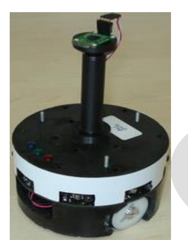
Fig 1: A picture of the KOBOT

Ali E. Turgut et al in their paper mentions two challenges for the Swarm Robotics system to be used in real world application [13]. First is the need for large numbers of robots, which settles for no less than the means of well-established mass production. Second is the need for robust, flexible and scalable coordination methods to operate on swarm robotic systems.