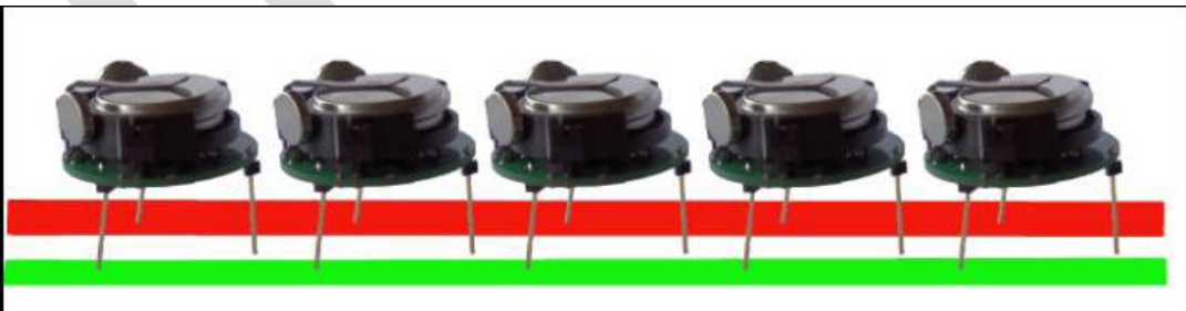
Figure 4. A visualization of the Kilobot charging scheme.

Each robot has a built in lithium ion battery charger, that will charge the on board battery when 6 volts is applied to the two slanted legs. The charger will automatically cease charging when the battery becomes full. This allows bulk charging of the Kilobots by placing each robot on a set of conducting strips attached to a 6v power supply, as visualized in Fig 4. This charging method is inspired from [8].