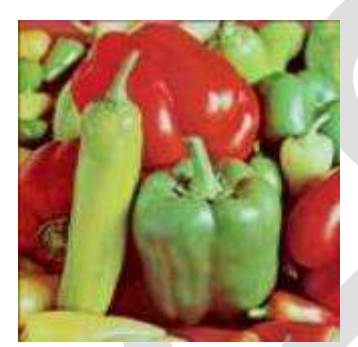
Fig 2: Original Image

To implement the process an input image is taken. If the image that we are taking is color then we have to convert it into grey scale. We have to take care of the size of the input image. Generally if the image exceeds the grey scale range the quality of stego image get affected and there is a chance of improper visualization. So in order to avoid such situations the range of the input image is limited. The input image is as shown below. The actual size is 160 \times 160 .We have to first convert this image into 256 \times 256 . For performing this operation we have an image resize function in MATLAB.