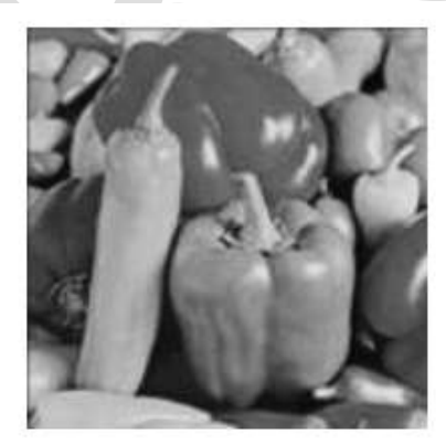
Fig 3:rgb2grey converted image

In order to convert the input image into the greyscale range we have rgb2grey function in the MATLAB. After the execution of this command our image will be converted into grey scale range. This image is again splitted into blocks for embedding purpose. The resultant image is the cover image in which we are embedding the data. If we take a grey scale image as cover image the processing operations will be rather simple.