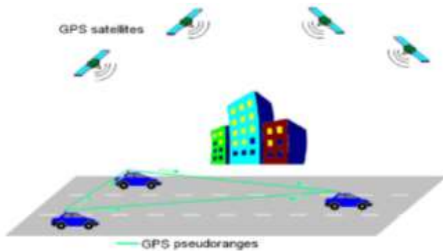
Fig.1: Proposed Model