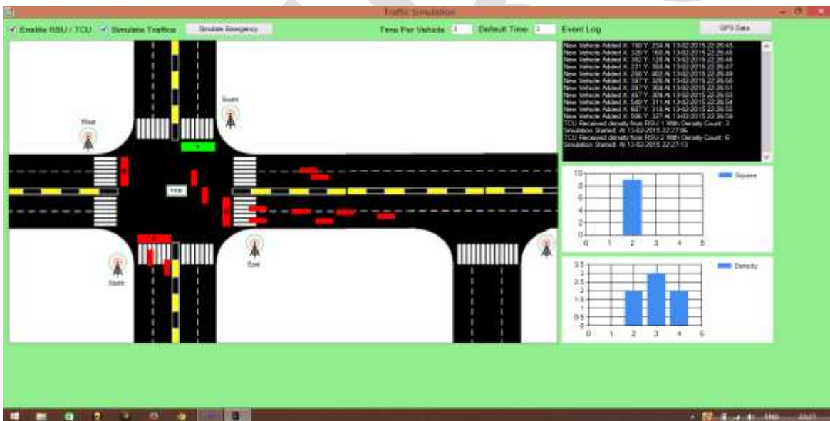
Fig.4: Traffic Density Calculation