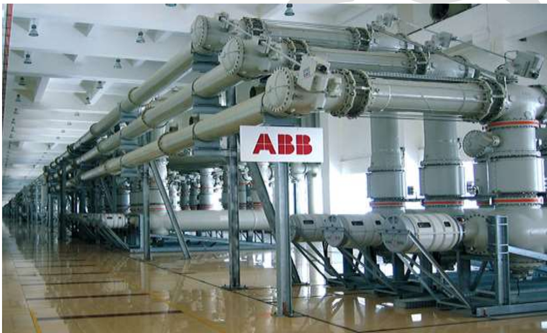
Figure 18 World's one of the largest SF6 gas insulated switchgear installation, at Three Gorges Dam in China: ELK-3 GIS, 73 bays, 550 kV

Gas insulated substations essentially take all of the equipment you would find in an outdoor substation and encapsulate it inside of metal housing. The air inside is replaced with a special inert gas, which allows all of the components to be much closer together without the risk of the flashover.