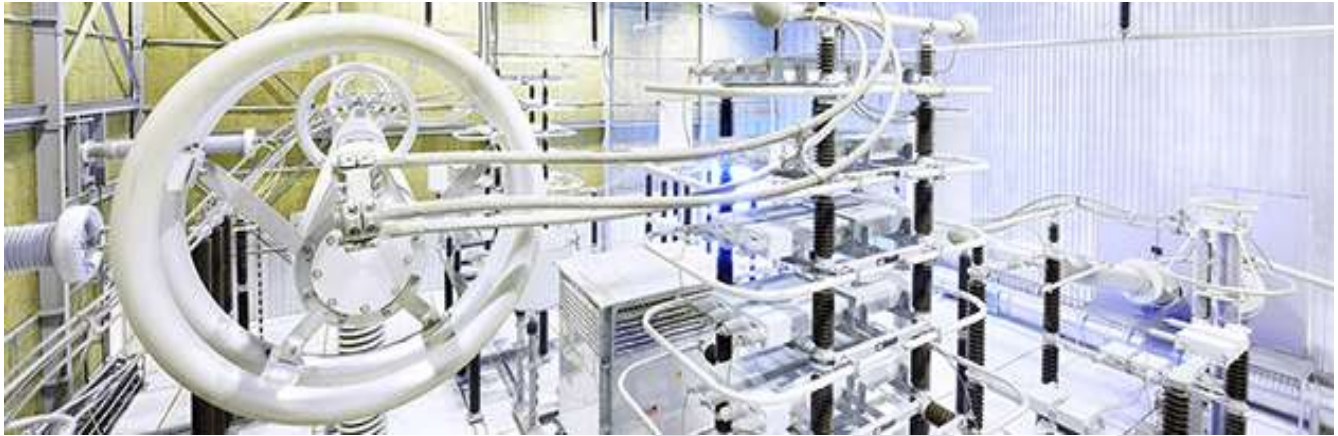
Figure 16 A 350 kV ABB HVDC Light transmission system that stabilizes weak power networks in Namibia also enables power trading in the expansive region of southern Africa.

Historically, the relatively high cost of HVDC terminal stations relegated the technology to being used only in long-haul applications like the Pacific DC Inertia, which connects the vast hydro power resources of the Columbia River with population centers of southern California. With the advent of new type of HVDC, invented by ABB and dubbed HVDC light, the benefits of DC transmission are now being realized on much shorter distances.