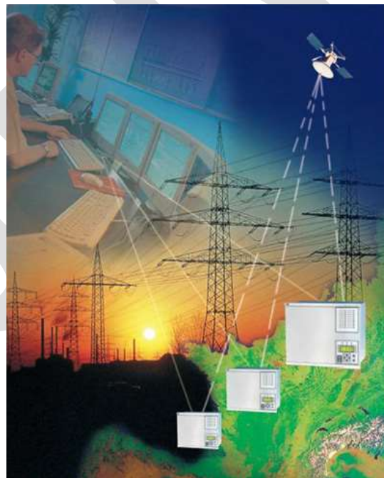
Figure 19 Wide Area Monitoring System

Wide area monitoring system has many promising capabilities, one of which is line thermal monitoring. With this functionality transmission operators could conceivably change the loading of transmission lines more freely by virtue of having a very clear understanding of how close a given line really is to its thermal limits.