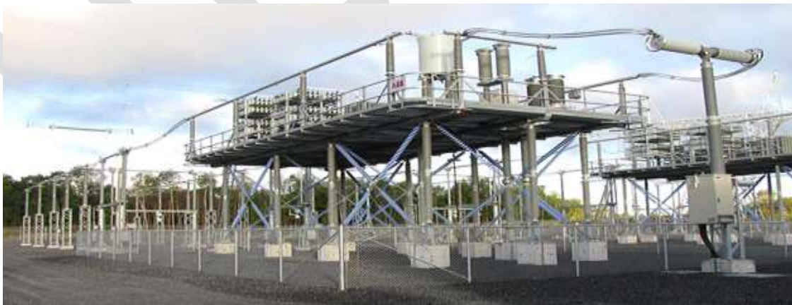
Figure 17 ABB Flexible AC transmission systems (FACTS) installation in Canada

A family of power electronics devices known as Flexible AC transmission systems, or FACTS , provides a variety of benefits for increasing transmission efficiency. Perhaps the most immediate is their ability to allow existing AC lines to be loaded more heavily without increasing the risk of disturbances on the systems.