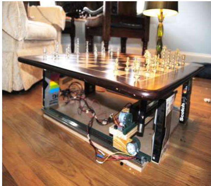
Fig.1 Chess board