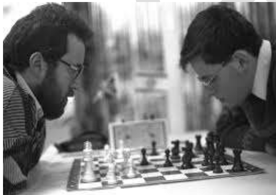
Fig. 2 Player playing chess