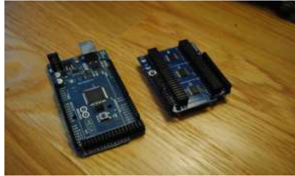
Fig:- 5 Arduino mux Shield

The Arduino board is acting in master and slave configuration. Arduino mux shield and Uno board is shown in figure 5. If the on board shield is sending the information then it is acting in master mode and the shield receiving information is acting in slave mode. The shield is basically used to send or to receive the move played by the user. The boards are connected via wireless link such as Bluetooth or RF module and depending upon the range of technique the distance between the two boards is decided for proper working condition.