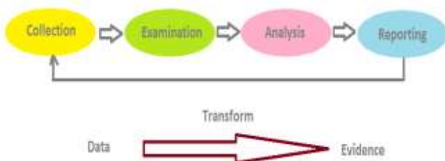
Figure 1: Digital Forensic Processes