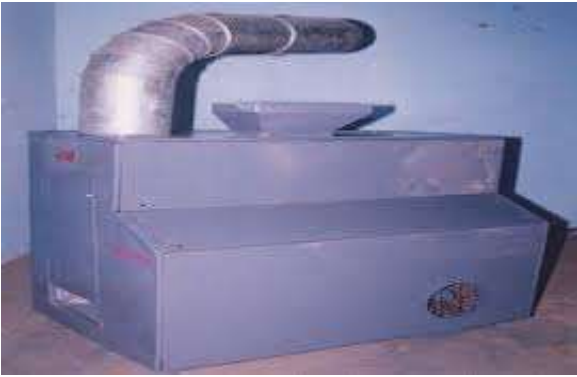
Fig.2 Garlic peeling machine developed by Nagrajan

Farm machinery and power technology who works on the pre and post harvesting machineries developed a garlic clove peeling machines (batch and continuous type) with 10-kg/hr capacity have been developed. The batch type garlic clove peeling has been evaluated and found satisfactory with 92-94 per cent efficiency. A flaking machine for pressing the cloves before dehydration has been designed. The machine is useful in flaking the cloves before drying, thereby enhancing the drying rate.