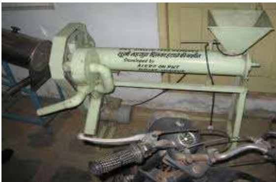
Fig.1 Garlic peeling machine developed at Udaipur centre

All India Coordinated Research Project on Post Harvest Technology, a project coordinated by Dr. S.K. Nanda, an improved garlic bulb breaking machine (cost Rs 11000, capacity 800 kg/h), a garlic clove flaking machine (cost Rs 11,000, capacity 420 kg/h) as well as a garlic peeling machine (cost Rs 10,000 for batch type and Rs 70,000 for continuous type, both capacities 15-22 kg/h) have been developed by Udaipur centre to remove the drudgery and mechanize these operations. First two prototypes have been transferred to 3 manufacturers each