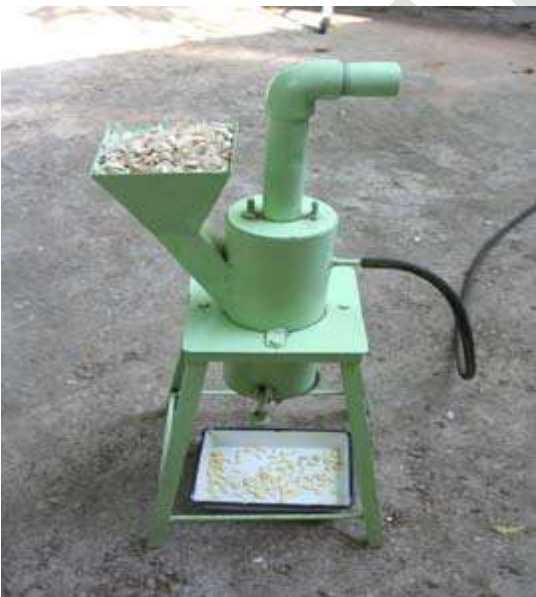
Fig. 3 Garlic peeling machine developed by Farm Machinery and Power Engineering

Farm machinery and power technology who works on the pre and post harvesting machineries developed a garlic clove peeling machines (batch and continuous type) with 10-kg/hr capacity have been developed. The batch type garlic clove peeling has been evaluated and found satisfactory with 92-94 per cent efficiency. A flaking machine for pressing the cloves before dehydration has been designed. The machine is useful in flaking the cloves before drying, thereby enhancing the drying rate.