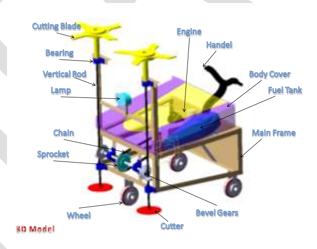
Fig 4: 3D Model of Sugarcane Harvesting Machine