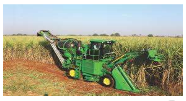
Fig 3: Mechanized harvesting machine