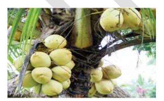
Fig 1: Tender coconuts

Coconut is the "tree of heaven", provides many necessities of life including food and shelter. It is mainly cultivated for its nuts; it yields oil, oil cake and fibre. Water from tender coconut is a common refreshing drink and has been used as an excellent isotonic in several tropical countries. It is not only a thirst-quenching liquid, but also a mineral drink, which is beneficial to human health. It contains traces of proteins, fats, and minerals like Na, K, Ca, Fe, Cu, P, S, Cl, vitamin C, vitamins of the B group like nicotinic acid, pantothenic acid, riboflavin and biotin. Coconut water contains organic compounds possessing healthy growth promoting properties. It carries nutrients and oxygen to cells, raise the human metabolism, boost human immune system, detoxify and fight viruses, control diabetes and also aids the human body in fighting against viruses that causes flue, herpes and AIDS.