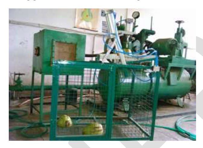
Fig 5 : Working model of punch cum splitter for tender coconut

(1-Base frame,2-Mesh,3-Holder ring,4-Pneumatic cylinder for punch,5- Pneumatic cylinder for slice,6-Punching bit,7-Slicing blade,8-Hose pipe,9-Solenoid valve,10-Air compressor,11-Tender coconut.)