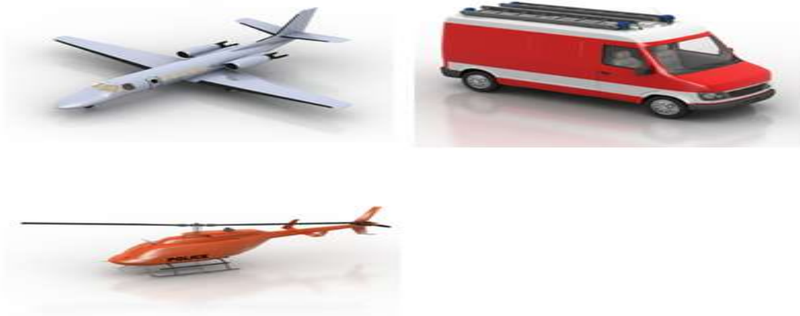
Fig. 7. 3D model images