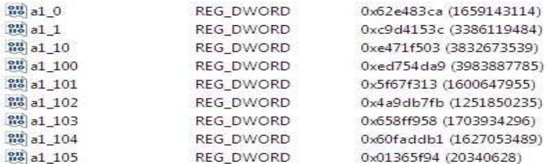
Fig. 5. Random registry value

HKU\S-1-5-21-583907252-162531612-682003330-1003\Software\Aipwr\1207202201\1653384842: 0x00000000