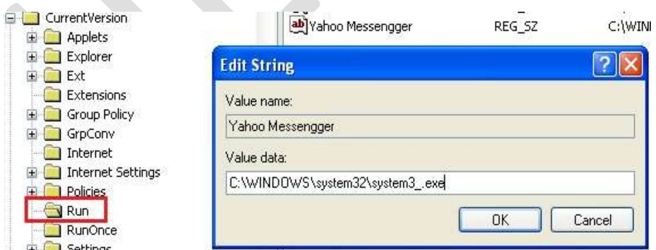
Fig. 3. Malware create registry key to autostart

HKCU\Software\Microsoft\Windows\CurrentVersion\Run\Yahoo Messenger: C:\WINDOWS\system32\system3_.exe