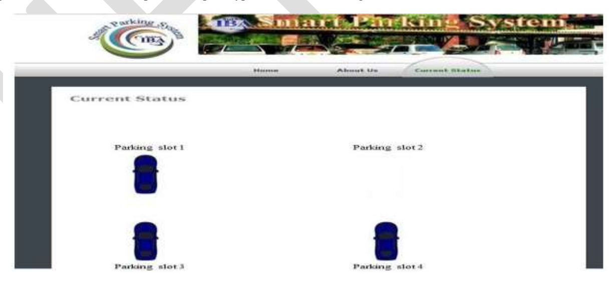
Figure 5: Web Server Interface

In parking plaza each spot have pre-installed sensors, which continuously transmit data to the web server through serial transmission port, using Arduino UNO. As soon as the data reaches to the server, it updates the website created by using .Asp. Now data is continuously updating to the website on the Webserver. The Web server interface is also shown in Fig 5. Through the windows phone application a user can view the run time status of parking plaza even with the details of parking lots (Which parking lots are free and which parking lots are reserved). Our implemented prototype is also shown in Fig 6.