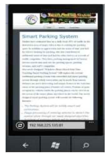
Figure 3: Windows Phone App GUI (c)

The designed and implemented prototype is a smart and cost effective system; it not only customizes the parking capabilities of parking area but also provide the real time monitoring from remote location. The exact free parking lot can be found using the smart phone app even in the most crowded parking areas. This helps to parking management system to save fuel, and reduce the frustration level of drivers searching for available parking spaces.