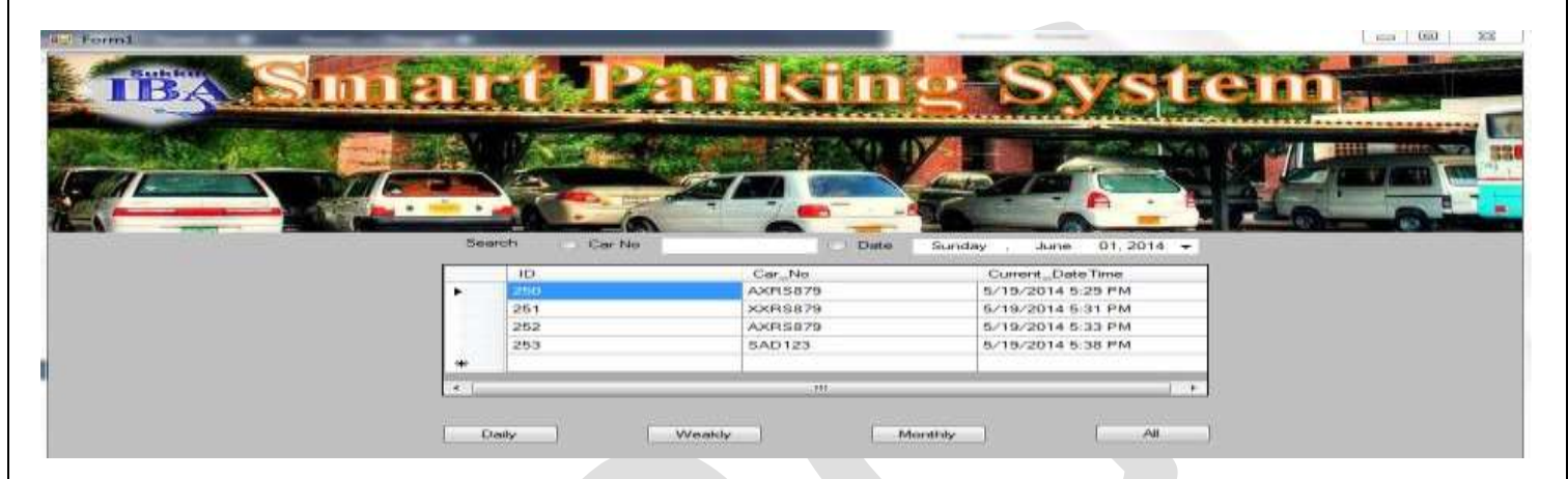
Figure 4: MATLAB GUI Database of every entering vehicle

Vehicle Number Recognition is an important phase of smart parking system. Number plate extraction and recognition is done by using MATLAB algorithm. The system also have also database & GUI based java software for the Smart Parking System as shown in Fig 4. Main purpose of database is to maintain the detailed record of vehicles, purpose of GUI based software is to access the stored record & search the vehicles against car number, time & date. C# is used as programming language for the development the GUI based software. The database can be used for collecting parking tax amount and can also be used for other legal purposes.