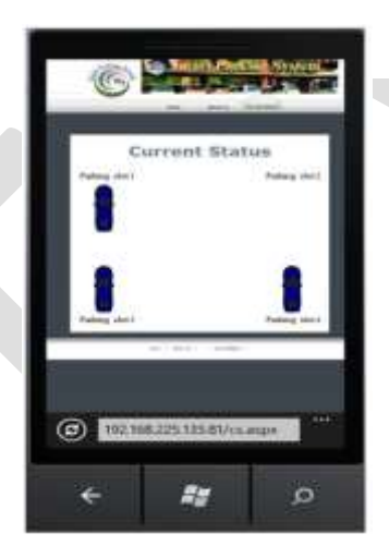
Figure 3: Windows Phone App GUI