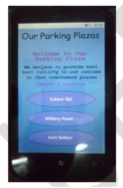
Figure 7: Windows Phone Application (a)

The Windows phone based application to choose desire parking area and check the current status remotely. The applications is first tested within the development environment using emulators and later subjected to field testing as shown in Fig 7(a) (b).