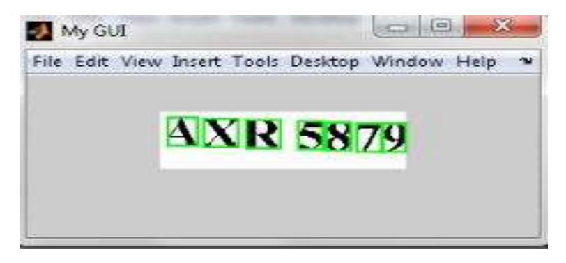
Figure 10: (a) Segmentation of Number Plate