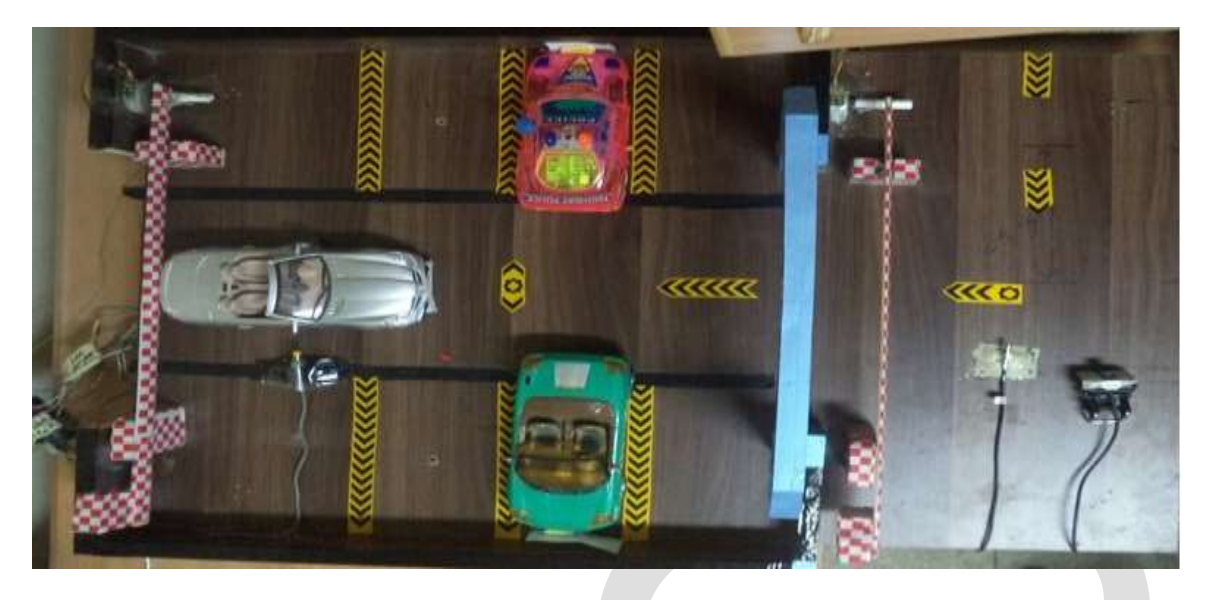
Figure 6: Prototype of Smart Parking System

The Windows phone based application to choose desire parking area and check the current status remotely. The applications is first tested within the development environment using emulators and later subjected to field testing as shown in Fig 7(a) (b).