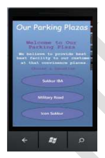
Figure 3: Windows Phone App GUI

A unique Smart Phone application is designed using C#, to track real time status of parking area. This app allow users to choose their desire parking location and remotely view the run time status of Parking area, so the user can view the exact parking area status even the most effective and innovative feature, proposed in this parking application is that user can exactly view the parking lots by lots which parking lots are reserved, which are still empty. The app takes the input from the consumer, as the user select any place in windows phone application to remotely view the status of parking spaces, the application connects itself with the central web server on back-end, using Hyper Text Transfer Protocol (HTTP) that location and it shows the real time status of the location as shown in Fig 3 (a) (b) (c).