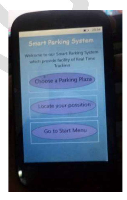
Figure 7: Windows Phone Application (b)