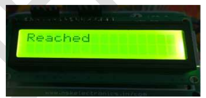
Fig 4: Display of the destination reached

Once the visually challenged person holding the smart stick reaches the destination the speaker will inform and that will be displayed in LCD as shown in figure 4.