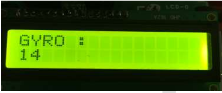
Fig 2: Range of gyro sensor

In this venture gyro sensors are used to obtain the angle of rotation while moving through the required path. The range is set between -512 to +512. The figure 2 shows the range of gyro compass sensor at 14Deg/sec.