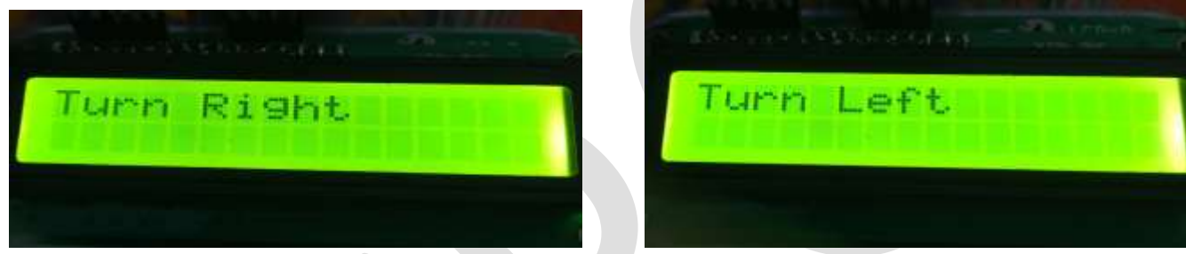
Fig 3: Directions to turn Right and Left

As the directions to the destined path will be prerecorded, whenever there is a deviation while travelling through the path the speaker located on the stick will inform in advance regarding whether to turn right or left. The same will be displayed on the LCD board present on the stick as shown in the above figure 3.