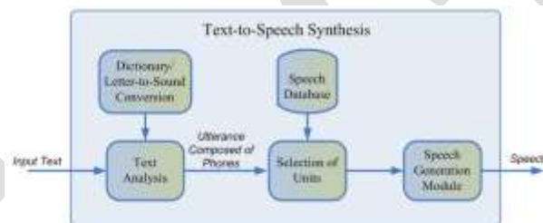
Fig. 1. Block Diagram of Marathi Text-To-Speech Synthesis System

Concatenative speech synthesis uses phones, di-phones, syllables, words and sentences as basic units. Speech is synthesized based on selecting these units from the database, called as a speech corpus. Many researches have been made, selecting each separate unit as the basic unit. When phones are selected as basic units, the size of the database will be less than 80 units for Indian languages. Database may be small, but phones provide very less co-articulation information across adjacent units, thus failing to model the dynamics of speech sounds. Di-phones and tri-phones as basic units, it will minimize the discontinuities at the concatenation points and captures the co-articulation effects. But a single example of each di-phone is not enough to produce good quality speech. So we are selecting syllable as a basic unit. Indian languages are syllable centered, where pronunciations are based on syllables. The general form of Indian language syllable is C^*VC^* , where C is a consonant, V is vowel and C^* indicates the presence of 0 or more consonants. There are defined set of syllabification rules formed by researchers, to produce computationally reasonable syllables. Some of the rules used to perform grapheme to syllable conversions [5][8] are: