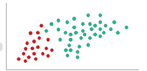
Figure 2: Naive bayes classifier the objects

Naïve bayes Classification consider the example given below: