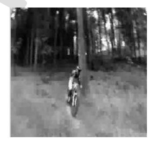
Figure 6: Retrieved frame