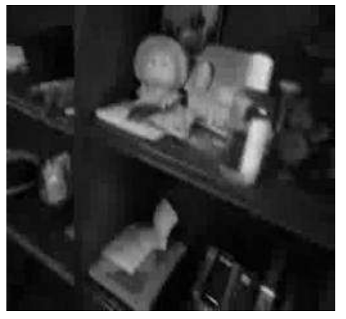
Figure 7: Original frame