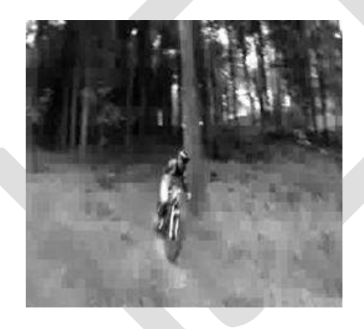
Figure 5: Original frame