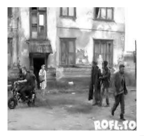
Figure 3: Original frame

The proposed architectures of algorithm has simulated using VHDL language using Xilinx 13.1 ISE. It has been implemented on Xilinx 13.1ISE, SPARTAN 3FPGA .We have taken three videos of AVI, 3GP, FLV and retrieved frames for each videos. For each video, Performance is measured in the form of parameters like Compression rate, PSNR ratio. Results of three videos are shown below