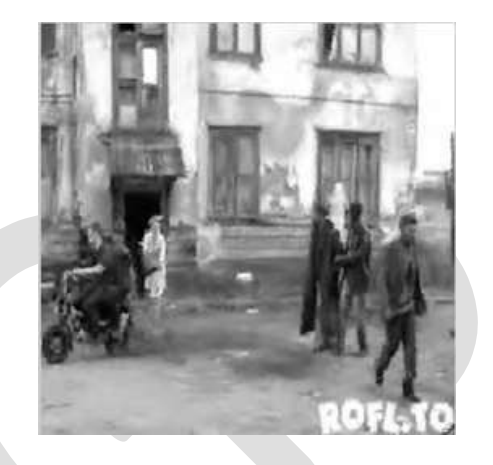
Figure 4: Retrieved frame