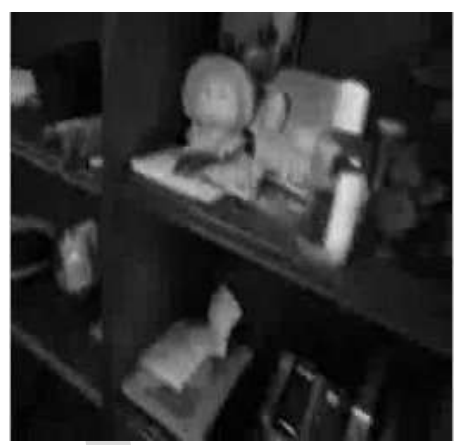
Figure 8: Retrieved frame