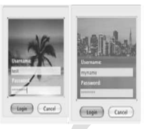
Figure 1 : Trusted Password Window

personal image serves as the background of the window. The personal image is also transparently overlaid onto the textboxes. This ensures that user focus is on the image at the point of text entry and makes it more difficult to spoof the password entry boxes.