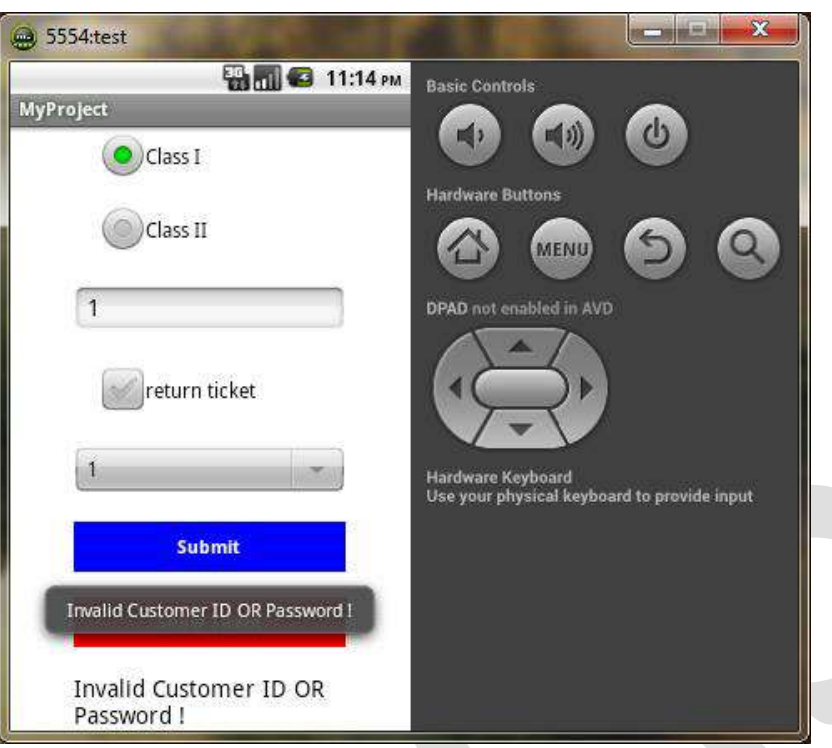
Fig: Error message for invalid id password