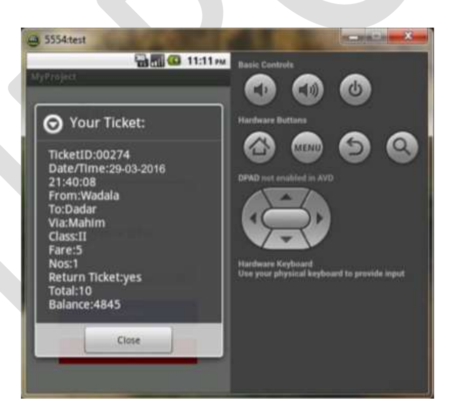
Fig: Ticket after successful booking