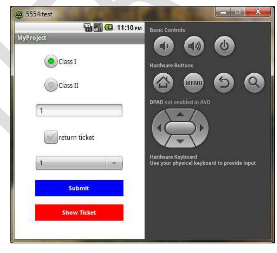
Fig: Ticket form www.ijergs.org