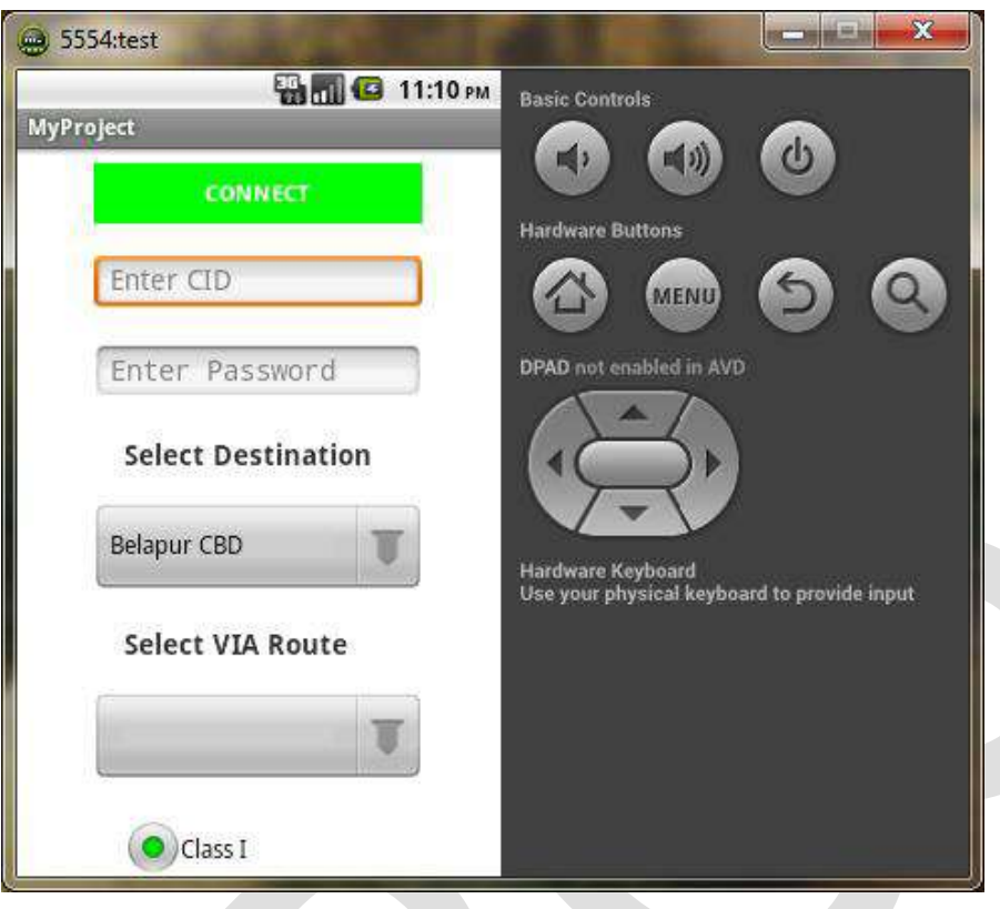
Fig: Ticket Form