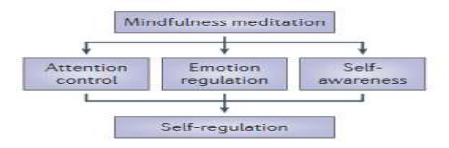
Fig. 2 Mindfulness Meditation[7]