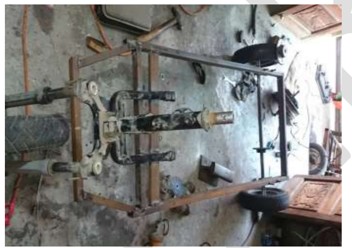
Fig.1. Actual chassis design