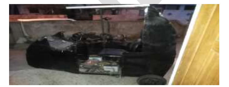
Fig.3. Final developed model