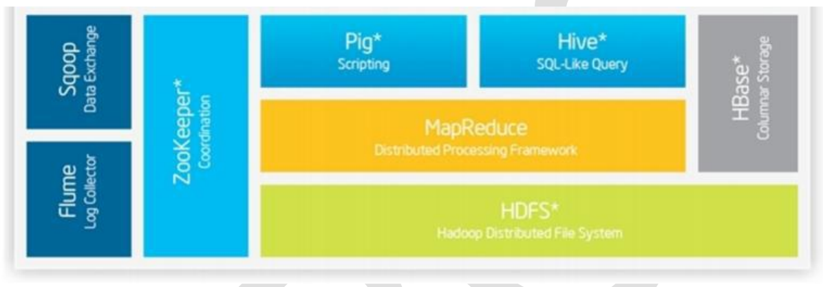
Figure 1: HADOOP Architecture

HADOOP is basically a framework provided by Apache which is used to run applications on systems which includes thousands of nodes and data is in the order of terabytes. It handles large amount of data by distributing it among the nodes. [4] It also helps system to work properly even when a node in the network fails. As a result risk of catastrophic system failure is reduced. Apache HADOOP consists of the HADOOP kernel, HADOOP distributed file system (HDFS) and map reduce paradigm. [5]