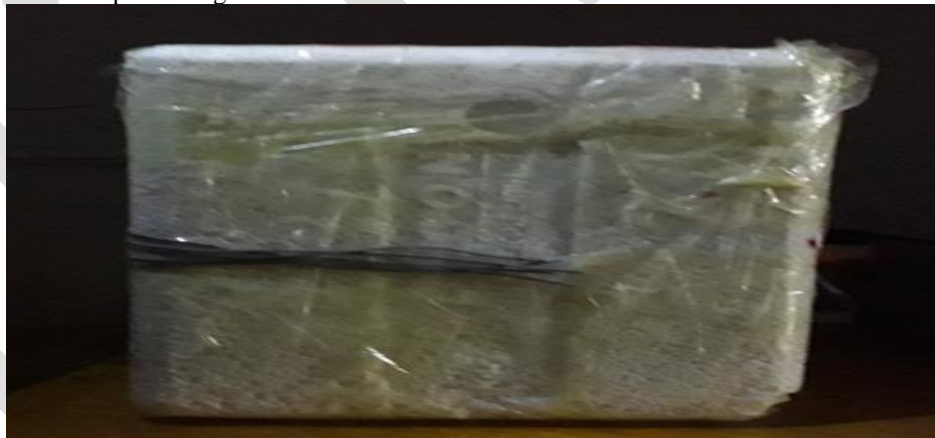
Figure 2: Fire extinguishing device

The device was handmade. It was produced inside a dormitory room, which proves the easiness of producing this device. Any factory can produce the amount of fire extinguishing device they need. The dry powder was placed inside the EPS box. The fuse was placed in the middle of the box. This would help to extinguish the maximum amount of fire.