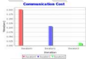
Figure3: Communication cost Graph